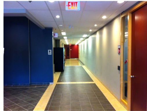
corridor & lobby